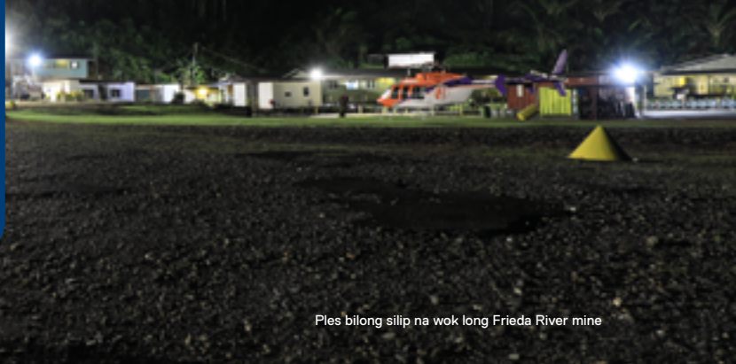
Ples bilong silip na wok long Frieda River mine